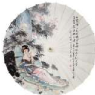
"Lady Figure Umbrella"