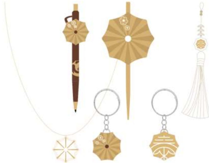
Figure 3.Oil-paper Umbrella Collection

These designs maintain the essence of traditional culture while incorporating fashionable design elements, making the products both artistic and functional.