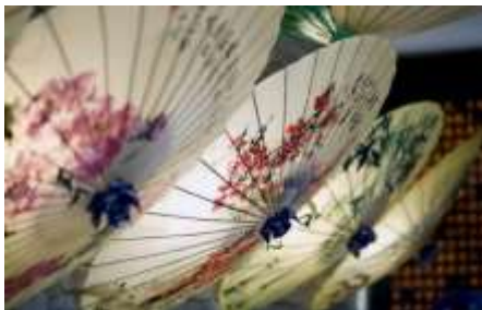
"Plum, Orchid, Bamboo, and Chrysanthemum"