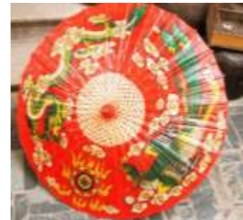
"Red Celebration Umbrella"

At the internal level, the cultural symbols of the oil-paper umbrella can be divided into three dimensions: metaphorical, behavioral, and narrative (as shown in Table 2). The transformation of material-level symbols primarily focuses on interpreting the materials and craftsmanship of the traditional oil-paper umbrella in a modern context. The choice of the oil-paper umbrella as the object of study is due to its unique structural aesthetic value and profound cultural symbolic significance. The circular design not only provides a visual sense of harmony but also conveys the beautiful metaphors of reunion and completeness; the radial arrangement of the umbrella ribs symbolizes a strong and unyielding spirit.