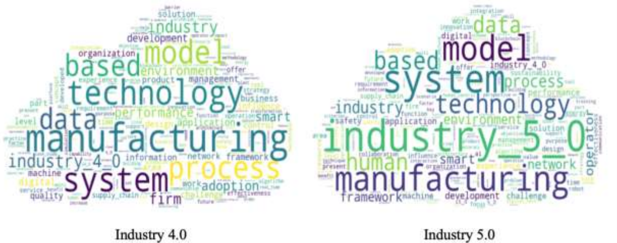
Figure 3. Word cloud by topics

The Industry 5.0 word cloud features terms such as "human," "system," "technology," "manufacturing," and "environment," reflecting a shift towards human-centric and sustainable approaches in industrial processes. Compared to Industry 4.0, Industry 5.0 emphasizes the integration of human elements with advanced technologies, as evidenced by the appearance of words like "human-centric," "collaboration," and "sustainability." This word cloud suggests a focus on how technology can be leveraged to not only improve efficiency but also enhance the human experience and ensure environmental sustainability.