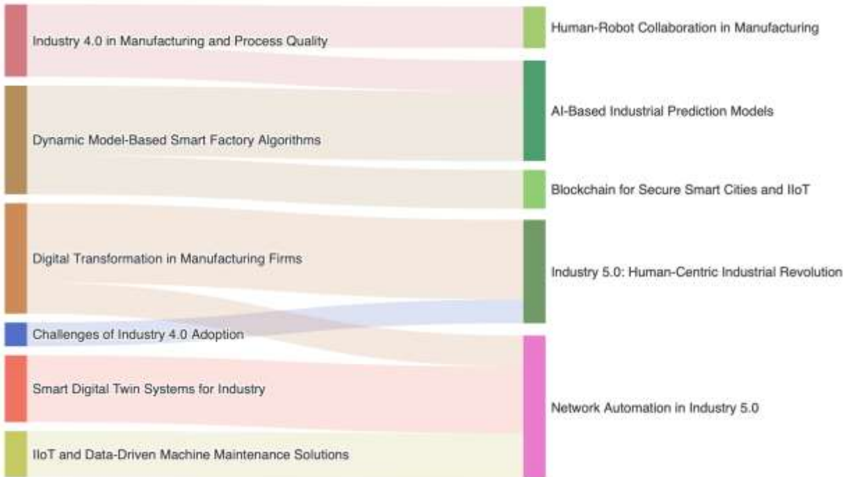
Figure 6. Topic Evolution Sankey Diagram