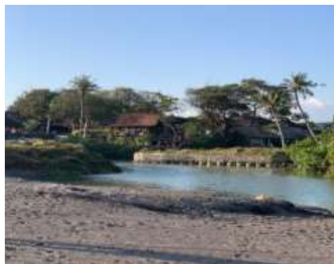
Figure 2. Brackish Water Immersion