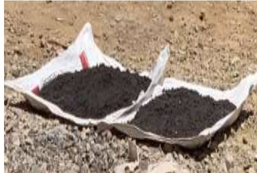
Figure 3. Tabas Stone Powder

The manufacture of test specimens involves the process of mixing fresh concrete which is carried out based on calculations from the Mix Design planning. In this process, all materials are mixed together with the addition of admixtures. Sample of Tabas Stone Powder used in the concrete mixing is shown in Figure 3.