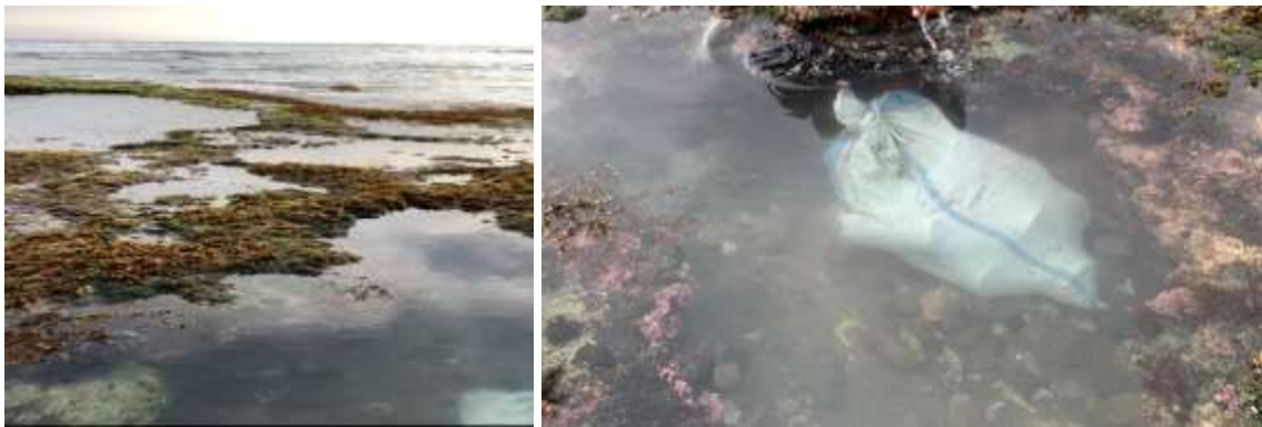
Figure 1. Seawater Immersion

The seawater and brackish water used in this study were located at Seseh Beach, Munggu, Bali as shown in Figure 1 and Figure 2. The results of water quality tests are summarised in Table 1. The results showed that that brackish water and salt water at the test location had different value on several parameters such as pH value, Total Dissolve Solid (TDS), electrical conductivity and salinity.