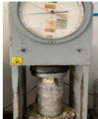
Figure 4. Compressive Strength Test

After the concrete mixture becomes homogeneous, the mixture is poured into a cylindrical mould. The test specimens are released from the mould after 24 hours. Then, the test specimens are cured in seawater, brackish water, and standard water conditions for a period of 28 days. After this period, the test specimens are taken back to the laboratory for compressive strength testing as shown in Figure 4.