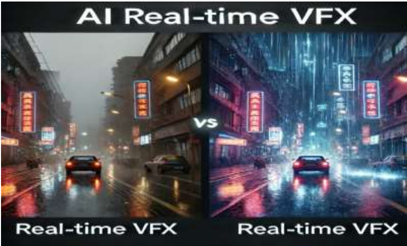
Figure 6. Before-and-after scene with real-time VFX, showcasing AI's impact.

AI-enhanced VFX and Scene Design: Implemented real-time VFX adjustments through AI, reducing the need for green screens. Figure 6 is the split-screen image illustrating the before-and-after effect of real-time VFX with AI enhancements. The transformation showcases how AI can add dynamic elements and create an immersive, atmospheric scene, demonstrating its impact on visual storytelling in film production.