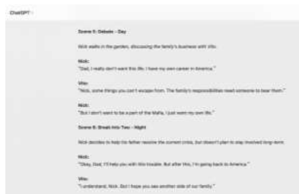
Figure 1. Using ChatGPT to create a story similar to "The Godfather"

The main limitations of AI-generated scripts lie in emotional depth and thematic complexity. While AI can learn technical screenwriting structures like "Save the Cat" beat sheets, it struggles with the subtlety and depth required in certain narratives. For example, when tasked with creating a story similar to *The Godfather*, ChatGPT successfully produced a plot but lacked the nuanced dialogue and layered themes of the original. Its interpretation of complex themes, such as the breakdown of the American Dream, often came across as blunt and lacking in literary artistry.(Figure 1)From a textual perspective, it is difficult for us to directly generate an excellent and complete script using current AI technology. We still lack understanding of emotions and the literary quality of the text, but AI can be used as an auxiliary tool for scriptwriting to improve work efficiency.