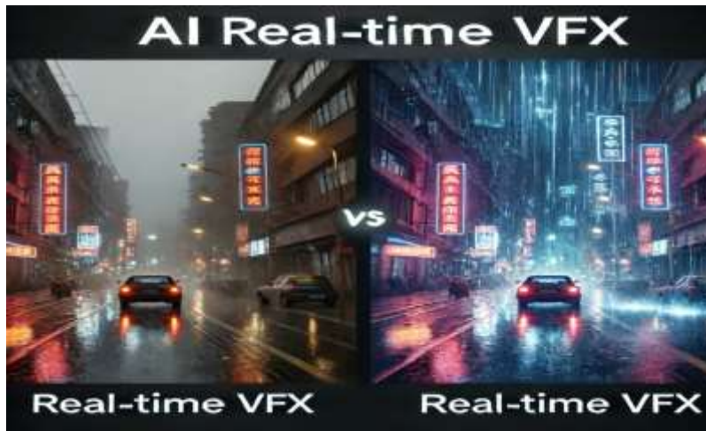
Figure 6. Before-and-after scene with real-time VFX, showcasing AI's impact.

AI-enhanced VFX and Scene Design: Implemented real-time VFX adjustments through AI, reducing the need for green screens. Figure 6 is the split-screen image illustrating the before-and-after effect of real-time VFX with AI enhancements. The transformation showcases how AI can add dynamic elements and create an immersive, atmospheric scene, demonstrating its impact on visual storytelling in film production.