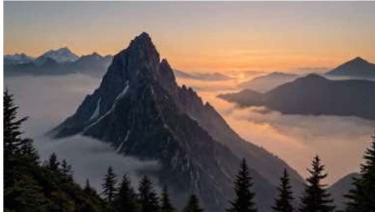
Figure 2. Empty shots generated using stability AI

in performances that feel flat or unnatural. For empty shots of scenes that do not contain people, AI can very well restore real-life scenes, especially some distant and panoramic scenery shots, which can be fully generated using AI, which can also greatly save shooting costs. Many scenes do not require realistic framing, and can shorten the film production cycle. (Figure 2)