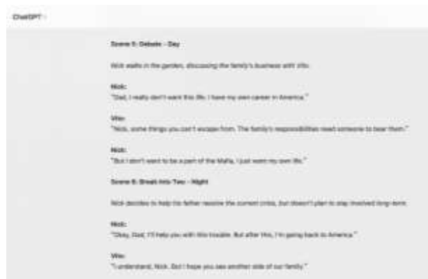
Figure 1. Using ChatGPT to create a story similar to "The Godfather"

The main limitations of AI-generated scripts lie in emotional depth and thematic complexity. While AI can learn technical screenwriting structures like "Save the Cat" beat sheets, it struggles with the subtlety and depth required in certain narratives. For example, when tasked with creating a story similar to *The Godfather*, ChatGPT successfully produced a plot but lacked the nuanced dialogue and layered themes of the original. Its interpretation of complex themes, such as the breakdown of the American Dream, often came across as blunt and lacking in literary artistry.(Figure 1)From a textual perspective, it is difficult for us to directly generate an excellent and complete script using current AI technology. We still lack understanding of emotions and the literary quality of the text, but AI can be used as an auxiliary tool for scriptwriting to improve work efficiency.