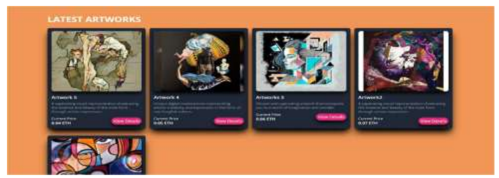
Figure 3. Latest Artwork