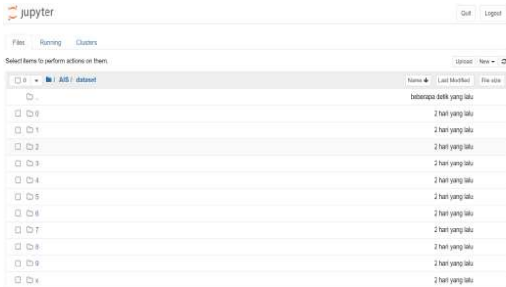
Figure 6. Data Set for Number Figure