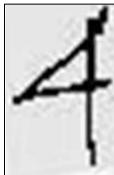
Figure 5. Cropped Handwriting Pattern

In order to acquire 6 characters of handwritten pattern character data, the data that the author has circled for each number will next be cropped; an example of the cropped handwriting pattern is shown in Figure 5.