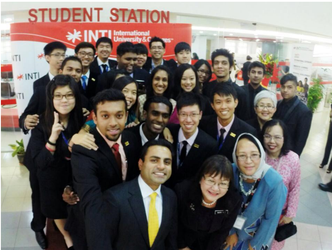
A selfie photo of 19 th INTIMA excos with Deputy minister of Education