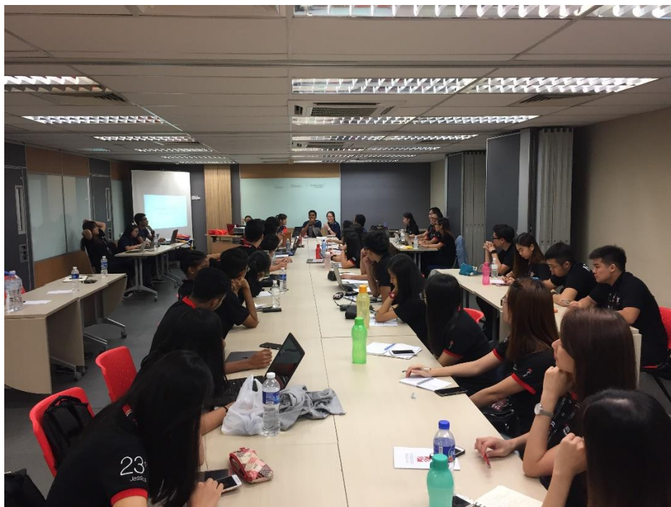
INTIMA Conference 2018 (All INTI Campuses)

In 2018 and 2019 I then joined as one of the EXCOs in INTIMA. I was the Public Relations Officer in 2018, then the President in 2019. Words alone cannot describe the experience I had in these two years, hence here are pictures of what I have gone through in these two years before the pandemic hit.