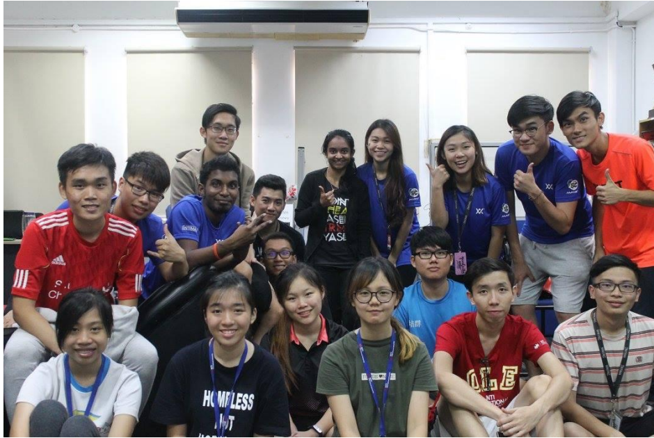
Meeting in the INTIMA Office

In 2018 and 2019 I then joined as one of the EXCOs in INTIMA. I was the Public Relations Officer in 2018, then the President in 2019. Words alone cannot describe the experience I had in these two years, hence here are pictures of what I have gone through in these two years before the pandemic hit.