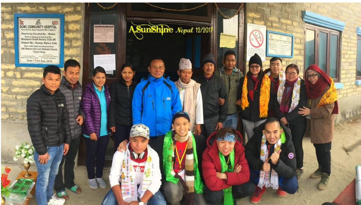
International charity treatment in DCWC Community hospital, Nepal