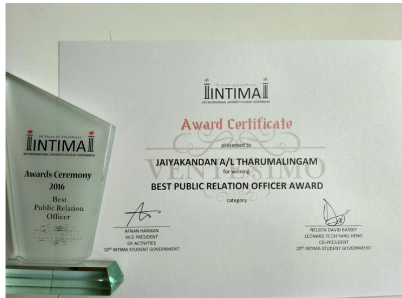
Awarded the best PRO during Installation Night

But one key difference that I learned very fast between Service Cell and being in a club is that you are on your own (Service cell, you had the INTIMA Excos who will guide you if you mess up). And that brings the learning curve even steeper, to how you grow your club's presence, helping the team in events and even leading and running some of the club events. It was where I honed my leadership skill and event planning skills the most. On top of building all the other soft skills (communication, teamwork and