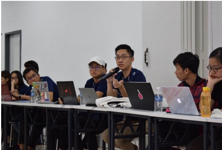
INTIMA Conference 2019 (Sabah)