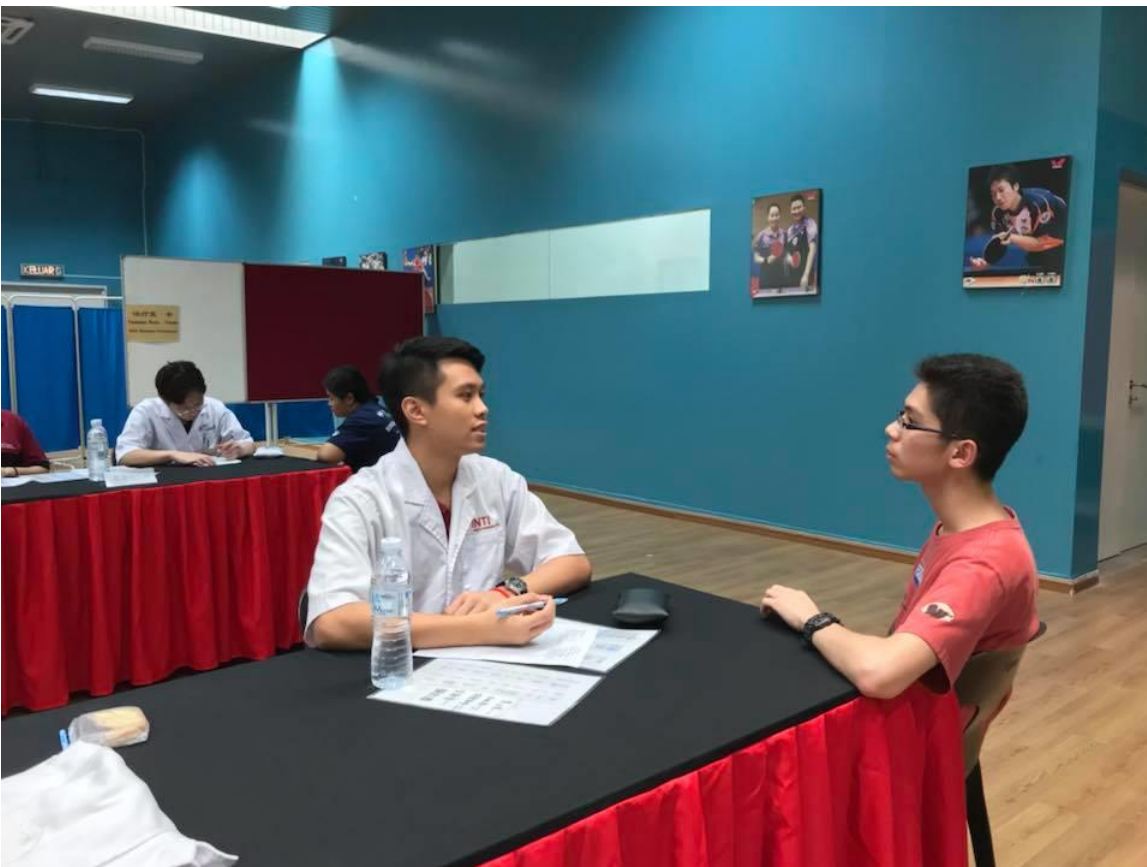
Local TCM charity treatment to repay to the society