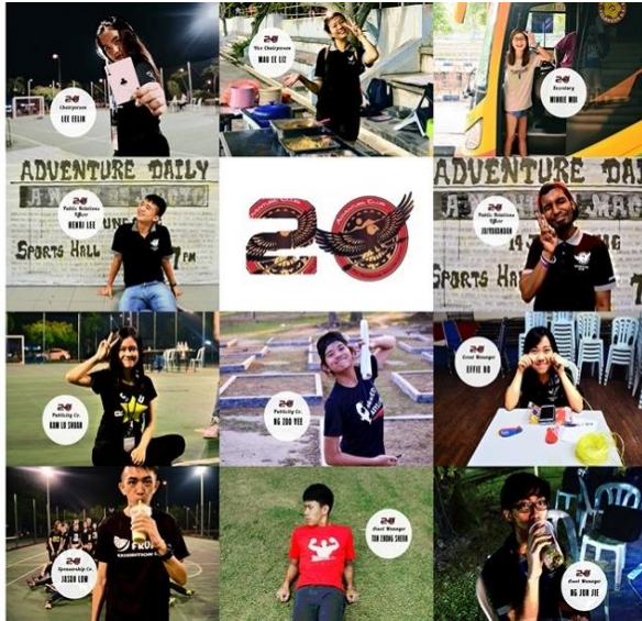
Adventure Club's 20 th General Committee Member

And when I saw that INTIMA were looking for Service Cell, (who in simple words are the group of students who assist the student government in co-planning and executing all INTIMA related initiatives), I jumped right into it and joined them! Learning something from behind the scenes gave me amazing insights from how the EXCOs addressed student