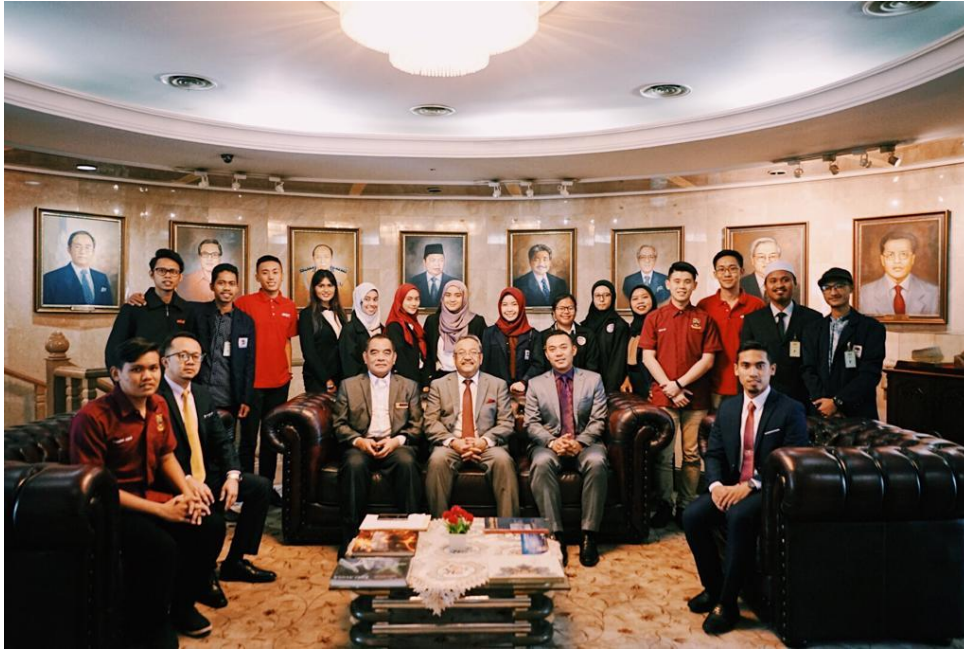
Trip to the Malaysian Embassy in Jakarta

All in all, I could not have asked for more from a university that has brought me countless experiences, met new people who have now become fast friends, and most importantly the lessons along the way. To whoever is reading this, especially if you are an INTlan, I wish you all the best in life, but before that, go have some fun in this university you now call home!