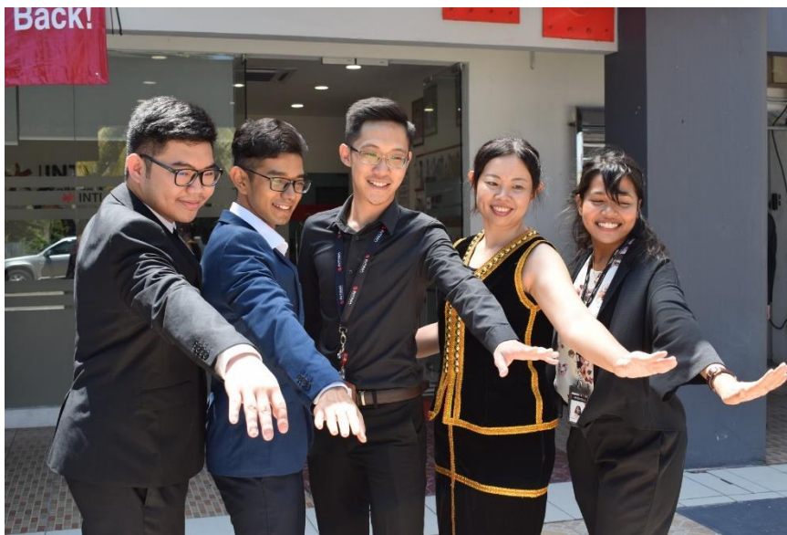
INTIMA Presidents from all campuses during the INTIMA Conference 2019