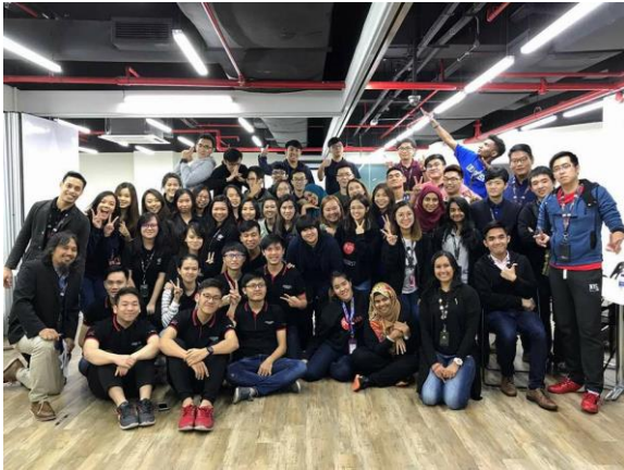
INTIMA Conference – INTIMA ExcOs from all INTI campuses