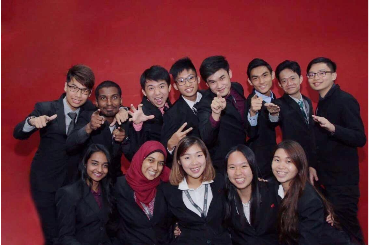
The 21st INTIMA EXCO

etc) and with my final year in university, that was the year I stepped into INTIMA office, as