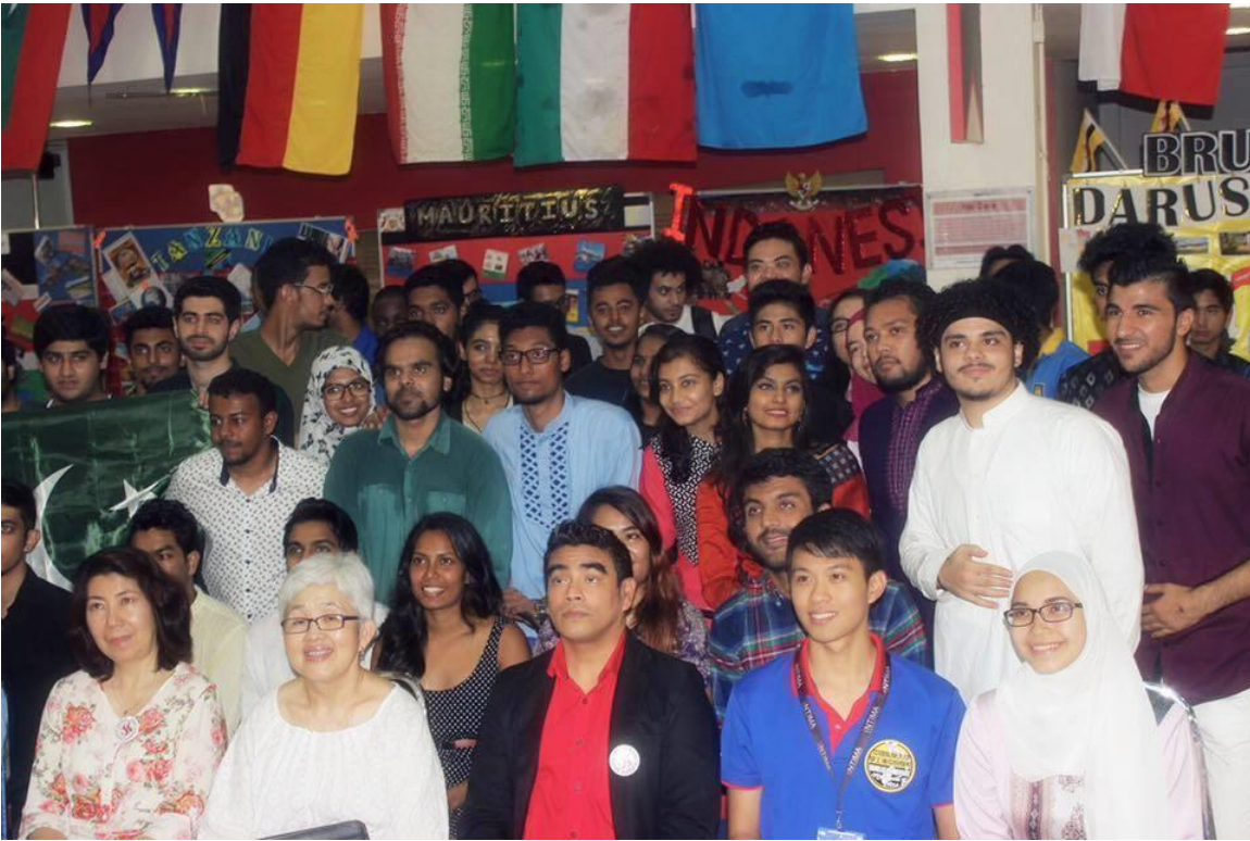
International student week to embrace diversity and inclusion