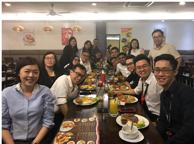
Dinner with EMC members with the 22 nd and 23 rd INTIMA EXCOs