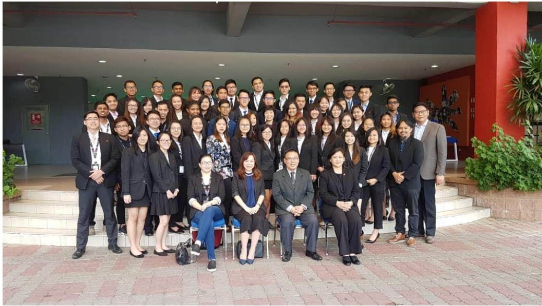
Group photo with all INTI Chief Executives and Vice Chancellor