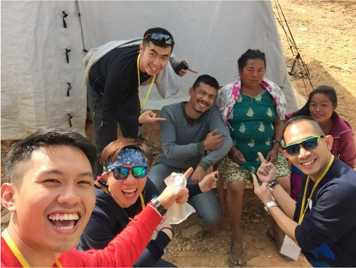
Fun interaction with patient, she was acting not to smile!