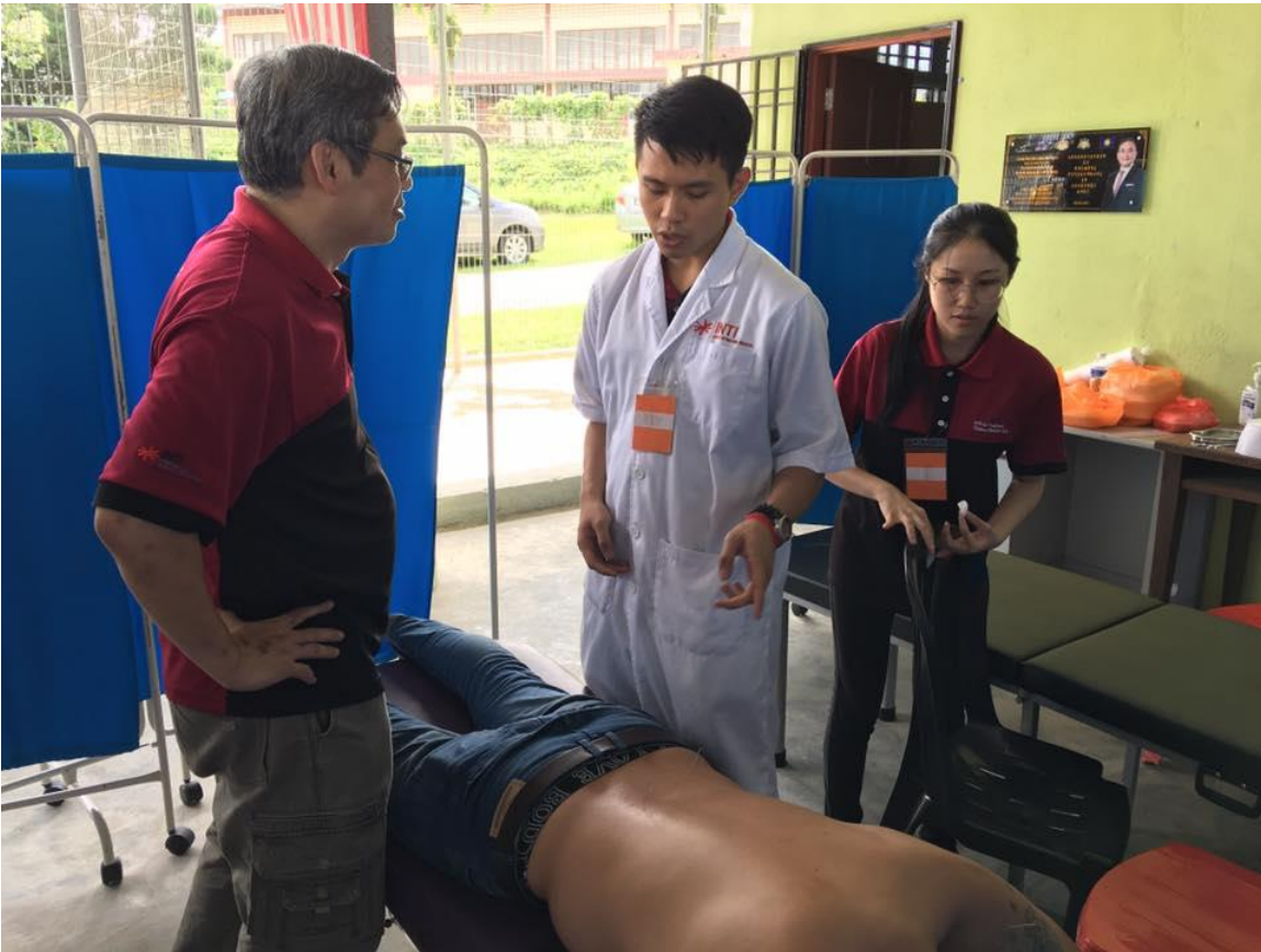
Having final year TCM acupuncture examination, demonstrating on how to accurately perform acupuncture for lower back pain