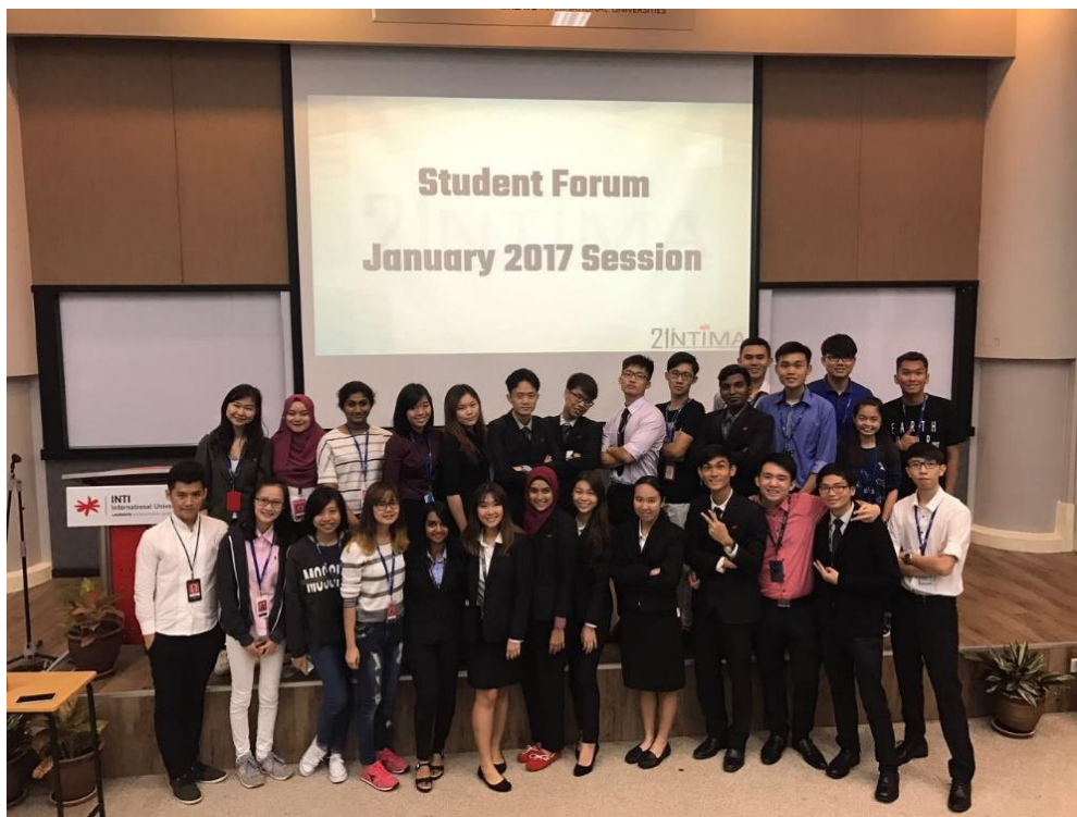
Student Forum Rehearsals