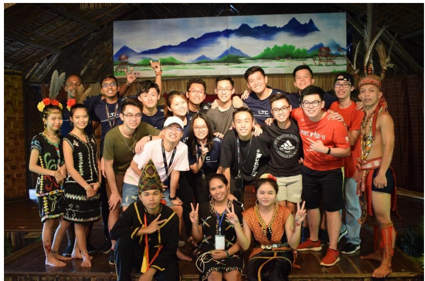
Trip to the cultural village in Sabah