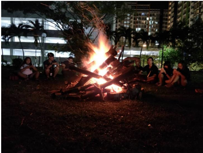
Campfire in INTI Nilai during the conference