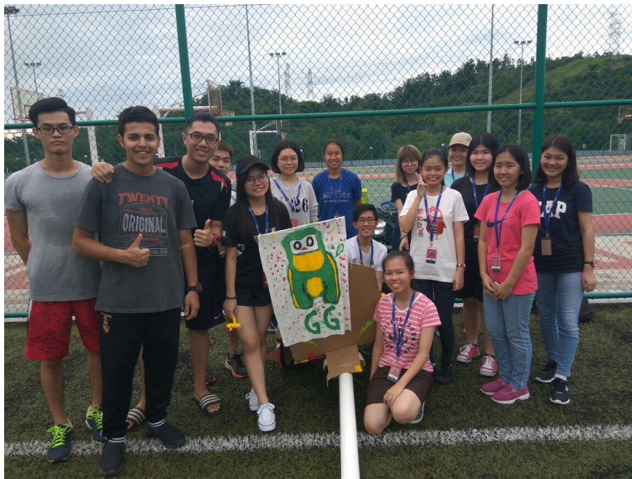
One of the activities in OLE (Build and Race Challenge)

Whilst the orientation was still on going, student leaders from the student government were already looking to recruit the newcomers who could have potential to be the next leaders of the student council. This was where I was introduced to INTIMA. INTIMA is the student government of INTI International University and once I heard about what they do and the opportunities they had, I was immediately hooked. That was when I joined INTIMA as a Service Cell, a sort of trainee organization under INTIMA where the current EXCOs would train the Service Cells to become future INTIMA EXCOs. The experience I had during my time as a Service Cell was like no other. It felt like an internship, National Service like experience all rolled into one. I had the best perspective of how the student council was run, how they spoke to the management, how they solved students' problems in the community and how they led us.