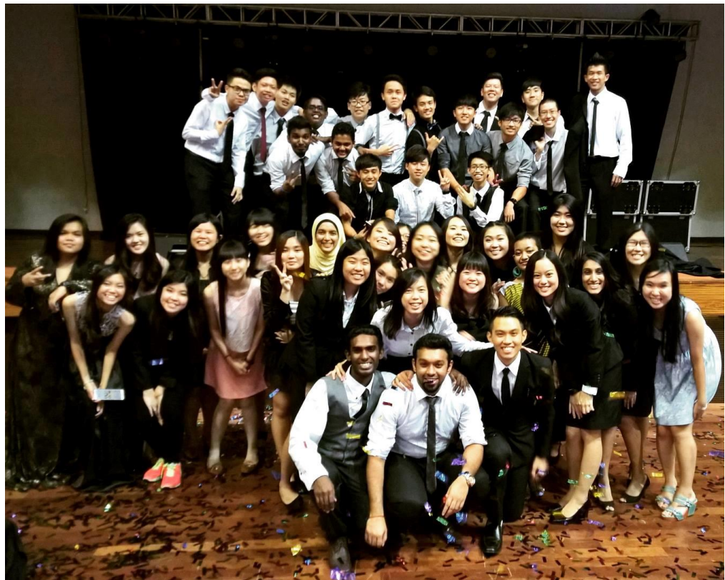
19 th INTIMA Service Cell & 19 th INTIMA.

But fast forward a year later, when I enrolled back in INTI for my degree, things changed 180 degrees. I attended one of the Student Forum's that was organized by INTIMA. That was the first time I found about the student government, and it sparked my interest in wanting to learn more to what they did for the university. That also created that passion for events (be it joining them or wanting to be a part of the event committee)