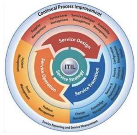
Figure 1. Concept Framework ITIL v3

The University of Muhammadiyah Palembang's UPT division designed IT incident management governance using the ITIL V3 framework, specifically on many websites. These designs are known as ITIL and IT Infrastructure Library. how to handle IT to accomplish corporate goals. With thorough checklists, tasks, and procedures that are adaptable to any kind of IT organization, ITIL gives full explanations of several key IT practices. The most recent version of ITIL, ITIL V3, contains five parts and is primarily concerned with overseeing the life cycle of services rendered by information technology. The ITIL V3 idea shown in Figure 1 below is as follows: