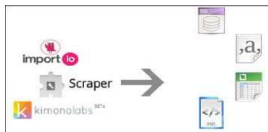
Figure 1. Online tools are available to perform data scraping into a various file formats

Web scraping is a technique to extract structured data from websites. The goals are to pull out valuable data to utilize other usages, such as improving other functions. The process involves extracting data from internet pages, recognizable proof, matching and combining comparative data, opinion extraction from online sources, idea progression, metaphysics, or learning mix (A. Yani, Pratiwi, & Muhardi, 2019). There are various ways to scrap data by using a programming language such as Python, C/C++, Java, R, or Ruby. Currently, Python is the most popular programming language for web scraping as many plugins are available such as BeautifulSoup and Scrapy. A technology solution to extract data from a website in the most efficient way, automated, and presented in a structured format is web scraping tools (Public, Information, Topic, & No, 2015). Figure 1 shows a few tools that are currently available to use.