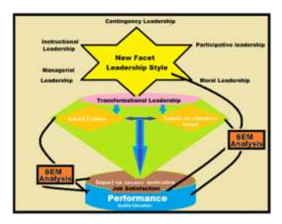
Figure 1 Leadership and Job Satisfaction Conceptual Framework for the Mauritian Education System