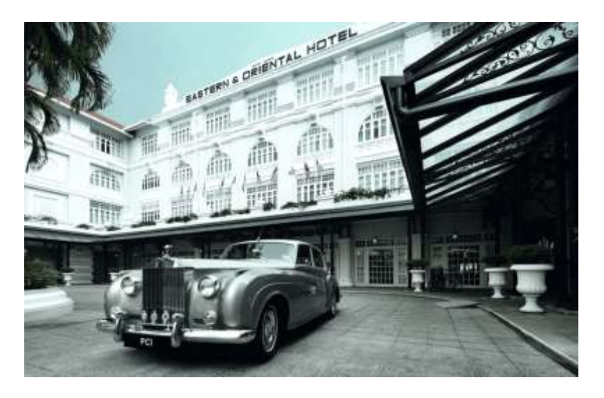
Figure 12. Eastern and Oriental Hotel, Penang