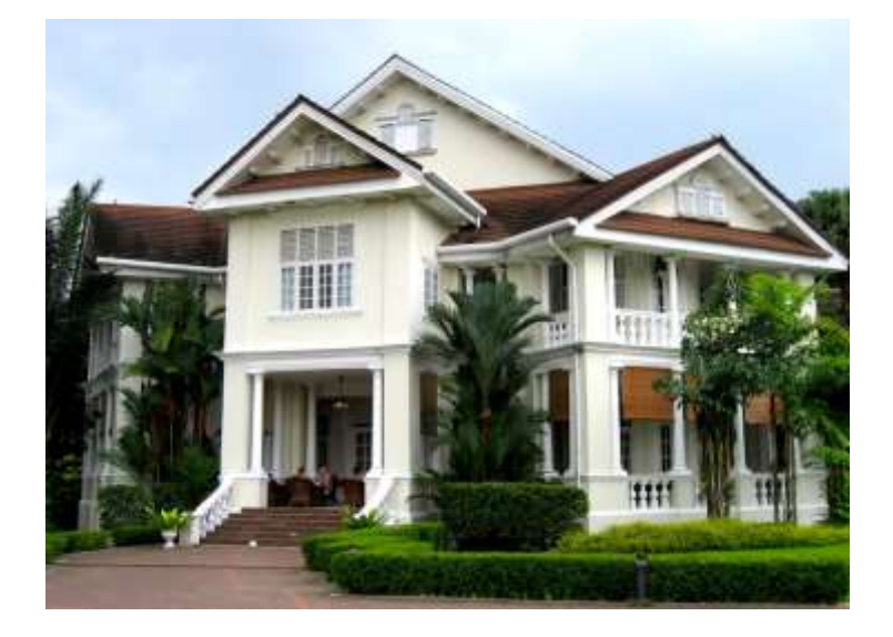
Figure 5. Carcosa Seri Negara, Kuala Lumpur

4. Airport hangar Subang Jaya, Petaling District, Selangor, Malaysia (Timestamp 51:31)