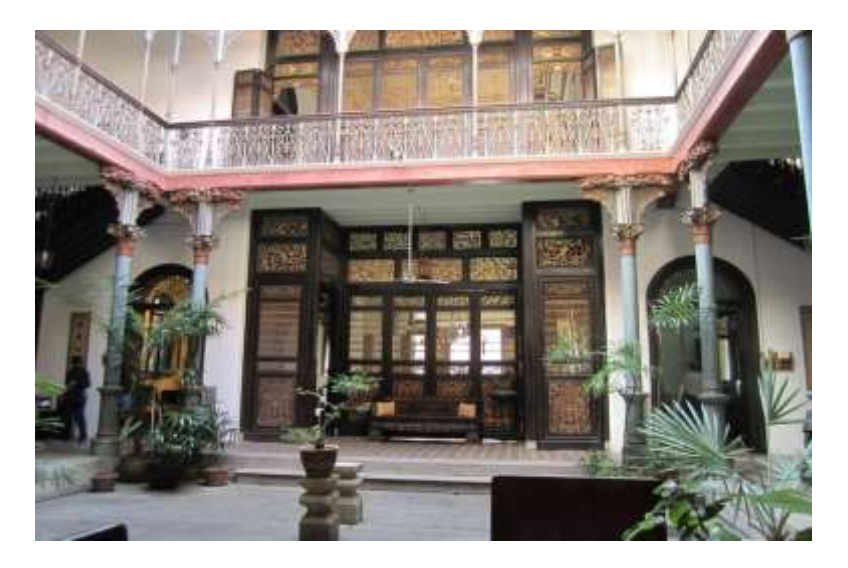
Figure 14. Penang's Cheong Fatt Sze Mansion