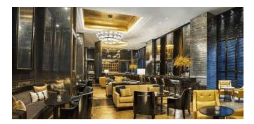
Figure 2. Astor Bar at St. Regis in Kuala Lumpur

2. Be-landa House, Kuala Lumpur (Timestamp 7:26)