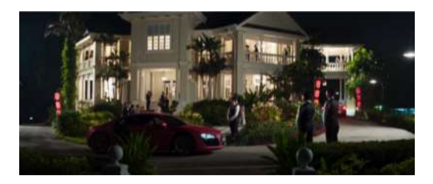
Figure 4. Carcosa Seri Negara, Kuala Lumpur

3. Carcosa Seri Negara, Kuala Lumpur (Timestamp 35:3)