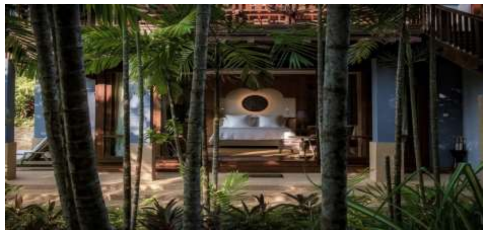
Figure 10. Four Seasons Resort Langkawi

7. Eastern and Oriental Hotel, Penang (Timestamp 01:04:54)