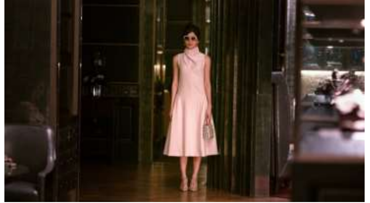
Figure 1. Astor Bar at St. Regis in Kuala Lumpur

1. Astor Bar at St. Regis in Kuala Lumpur (Timestamp 15:22)