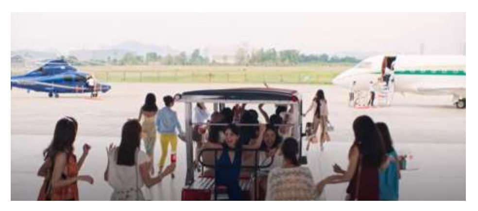
Figure 6. Airport hangar Subang Jaya, Petaling District, Selangor, Malaysia

4. Airport hangar Subang Jaya, Petaling District, Selangor, Malaysia (Timestamp 51:31)