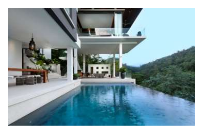
Figure 3. Be-landa House, Kuala Lumpur