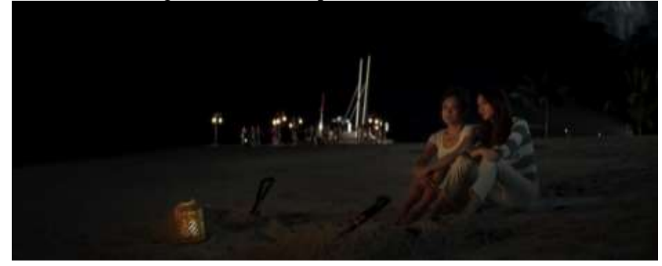
Figure 9. Four Seasons Resort Langkawi

6. Four Seasons Resort Langkawi (Timestamp 56:15)